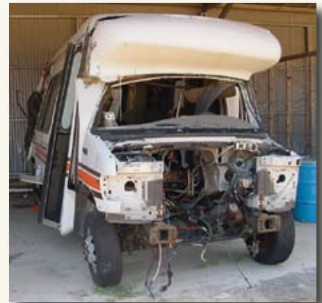
Bus used in crash testing