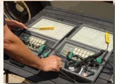
Air conditioning testing equipment

This test evaluates the emergency/park brake performance standard for all transit equipment purchased through FVPP contracts. The test is performed on a 150 inclined ramp in dry conditions, 150 pounds in each seat position and 250 pounds in each wheelchair position, to simulate a bus loaded to maximum passenger capacity. The brakes are also