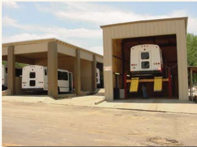
New bus inspection and water testing bays